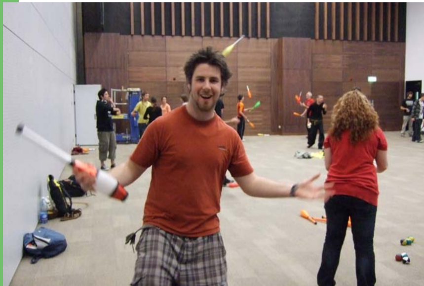
WE'VE GOT THE MOVES, WE'VE GOT THE MUSIC, WE'VE GOT IT ALL!: Juggling Soc and DJ Soc mix it up at their weekly session

Join ArtSoc for some therapeutic art and creativity as part of Mental Health Week