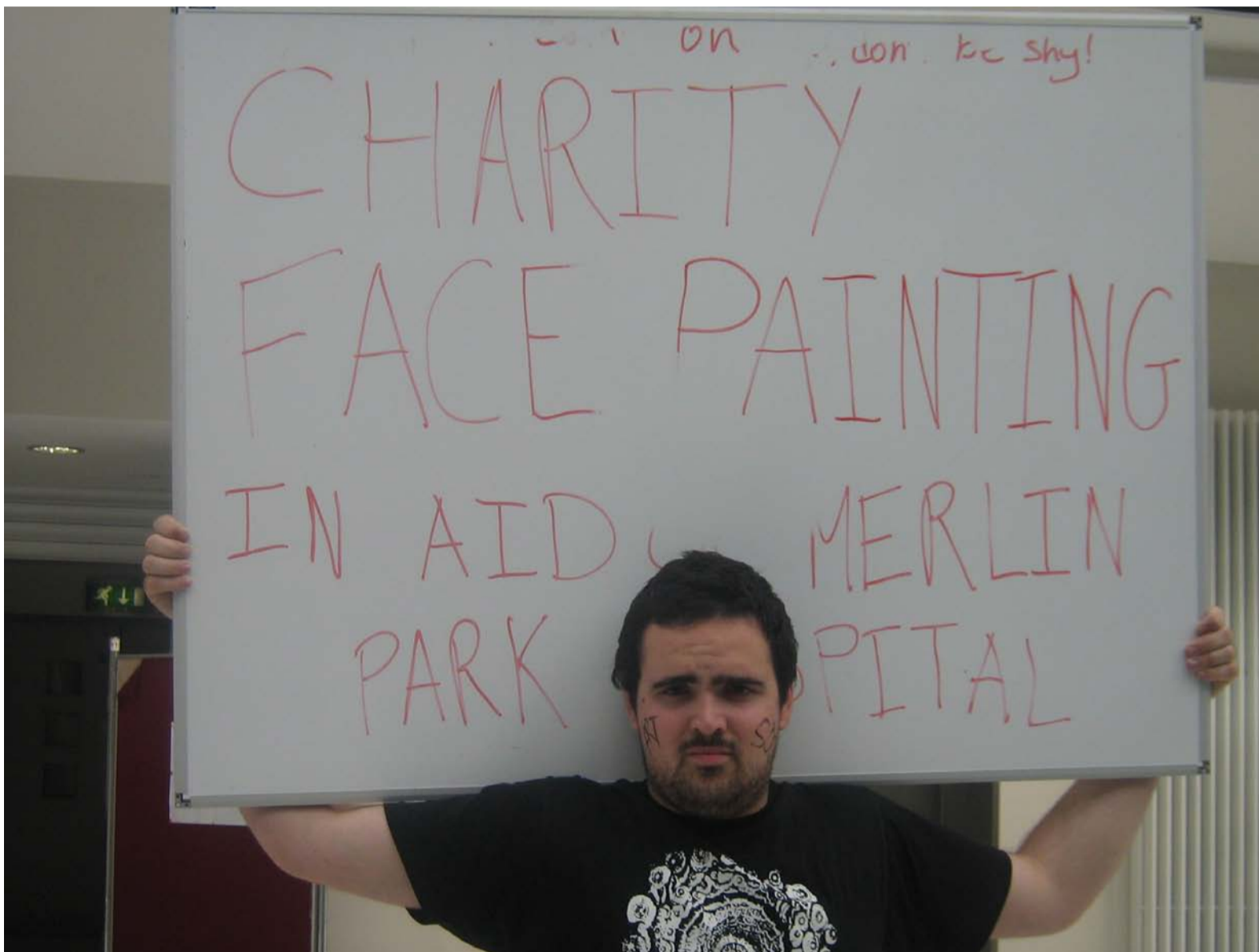
ARTSOC SHOW SOME LOVE: Face painting for charity in aid of Merlin Park Hospital's Psychiatric Ward

11th - 15th October is Mental Health Week! (Read More...)