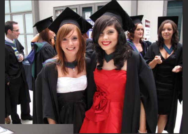
GRADUATION WEEK IN ÁRAS NA MAC LÉINN