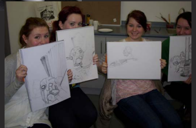
ART SOC CLASSES PAYING OFF!

THE WHAT'S HAPPENING GUIDE is a publication of the Societies' Office, NUI Galway.