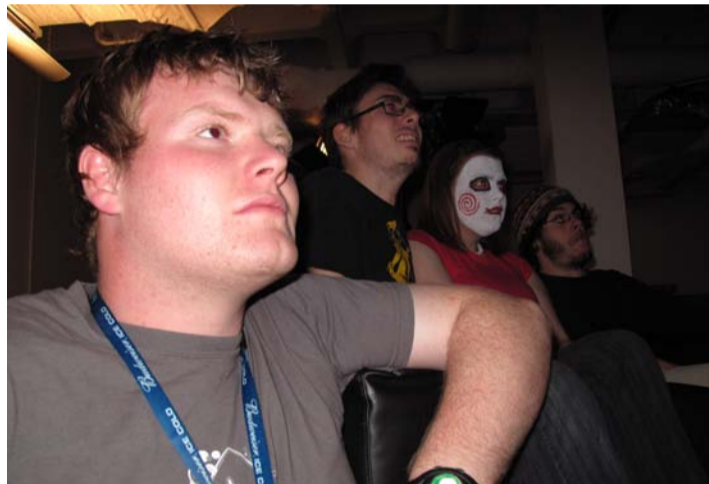
HORRIFIED CROWD AT BACON SOCS SAW-ATHON

Classes Time: 18:00 - 19.30 Venue: Large Acoustic Room