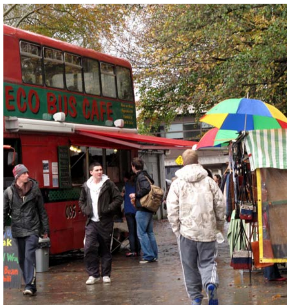
MINI MARKET: Outside Aras na Mac Leinn for Healthy living Week