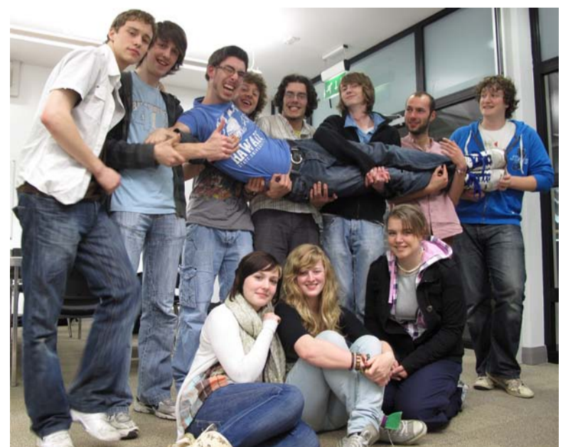
BACON SOC: Rehearsals for the Rockapella begin!